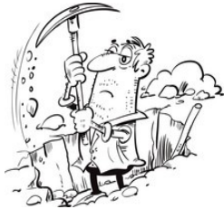
Dig, Dig, Dig!