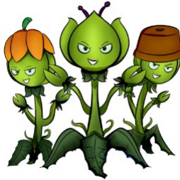
Collect up weeds