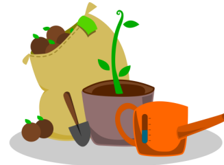
Make good and secure for the winter months

Autumn is underway now, with early evenings and colder days but there is still plenty to grow for over wintering to help reduce the workload for next spring when it is a busy time. It also occupies otherwise empty soil beds. There is a range of vegetables and dormant fruit trees you can plant now if the soil is not frozen.