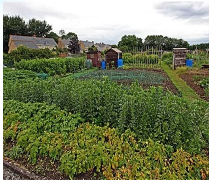
The Hamcrate Allotments—all very tidy and organised at the start of the season!